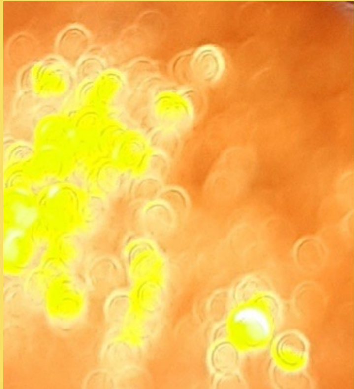
Photograph by Gill Hastie of the universal energy coming from the sun, following a meditation in nature. (Photo used with permission)

Nature can be your teacher in showing you how to achieve this, how to inhabit your body and access the silent knowledge through your DNA.