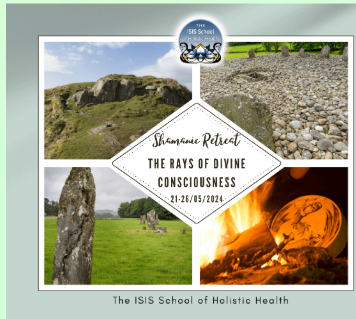
The ISIS School of Holistic Health

Purification of the karmic seeds through the fire of the luminous being is only possible as a result of the deep healing of the state of separation. Ceremony and ritual brings what is stuck in the unending turning of the wheel of karma into the forefront so that it can be seen, realised, released, and removed from the body. Healing the spiritual DNA takes people into a